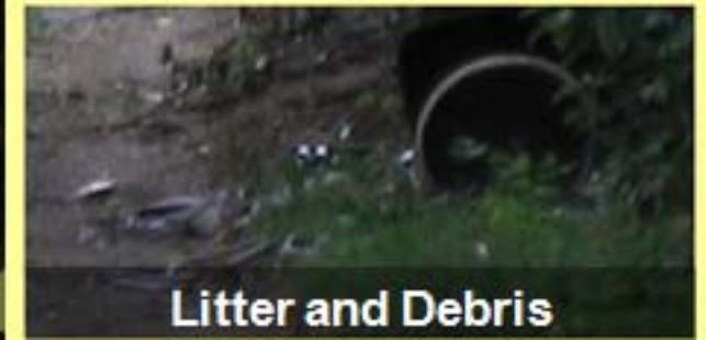
Litter and Debris